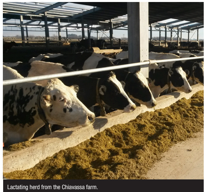
Lactating herd from the Chiavassa farm.

“ Milk yield declines by 0.2 kg per unit increase in the temperature and humidity index (THI) when this index exceeds 72. ”